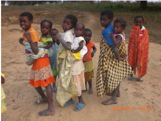
Young carers. Kibokolo District

Readers of our newsletters would certainly know that the school we plan to establish will be located in a rural area in Northern Angola. Here we give you a pictorial feel of the region, its people, opportunities and challenges.