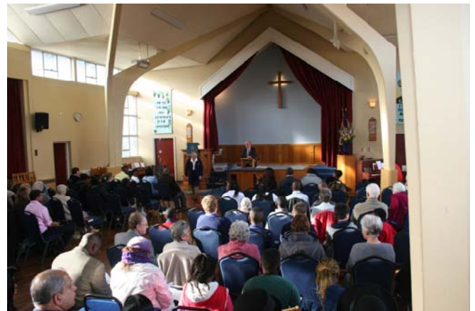
Sunday Service at Oldfield Baptist