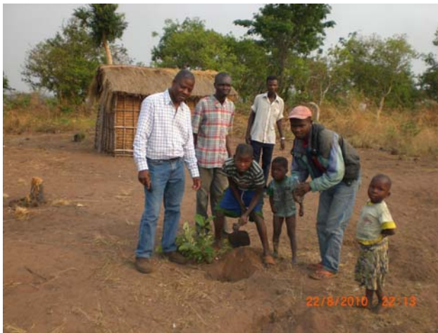
Hunting crickets. Sakandika district

You cannot miss to notice the people's resourcefulness, hospitality and joy.