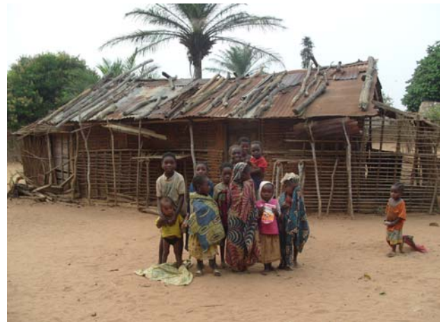
Diumba village, Kuilu Futa district