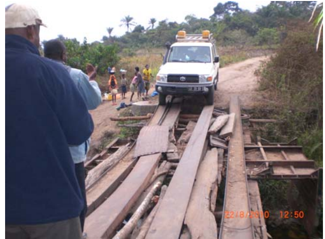
Test of nerves. Beu district

You cannot miss to notice the people's resourcefulness, hospitality and joy.