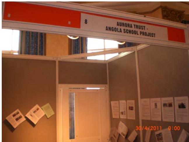
Aurora stall with leaflets on the wall

Two months ago Aurora had the opportunity to present its work to a larger audience exhibiting at the Baptist Assembly. This event took place in Blackpool during the weekend of 29 th May to 2 nd June 2011.