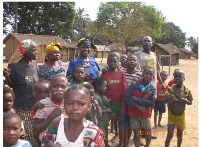
Welcome. Kidia village, Beu district

Children are the greatest resource in the region that needs harnessing.