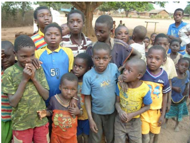
Keen boys. Kuilu Futa district

Children are the greatest resource in the region that needs harnessing.